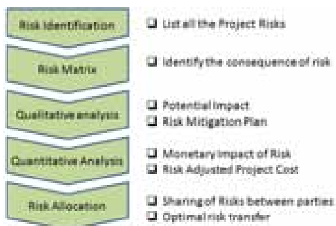
Figure 1 : Risk Management

Assessing and allocating risk to achieve added efficiency is what makes PPP a potentially powerful way of reducing project-related costs and achieving improved value for money for the public sector. The level of risk can be changed by allocating responsibility for individual risks to those who are best able to manage them. This is one of the most important component of defining an PPP project. The diagram below illustrates how Risk planning should be engaged into.